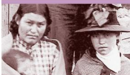
Women's History Month

October is Women's History Month . Visit the Status of Women Canada website for more information on how to participate in the #BecauseofHer social media campaign and for access to a variety of teaching resources .